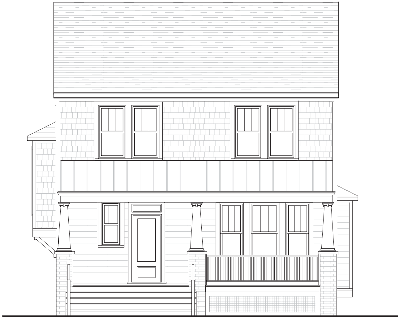
FRONT ELEVATION TYPE 2