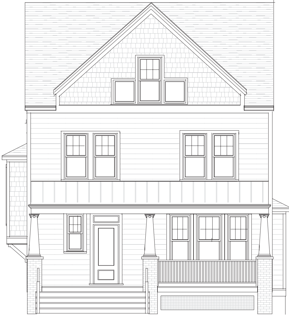
FRONT ELEVATION TYPE 6