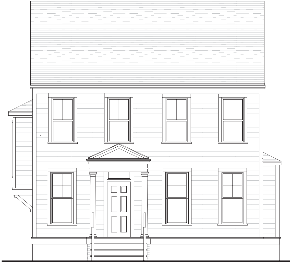
FRONT ELEVATION TYPE 3